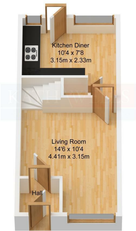
Ground Floor Approx. 24.05 sqm. (258.87 sqft.)